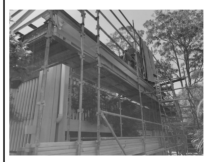
Scaffolding required for replacement of guttering

As you know, last year urgent repairs were undertaken to the presbytery at the Lindfield end of the parish, to address major problems with groundwater, mildew and roof run-off. We are grateful for the $40,000 plus donated by parishioners to address these works. However, much work remained to be done and so the parish has taken out a $75,000 loan to complete these essential works which include: replacement of all guttering, replacement of the veranda roof, repairs to the section of the dining room ceiling which fell in two years ago, repair to hole in lounge room wall eaten by rats two years ago, and a number of other things. The work will take three weeks to complete.