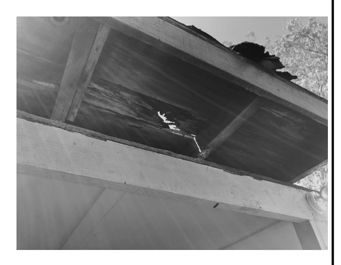
Nice view of the sky through the timbers of the eaves!