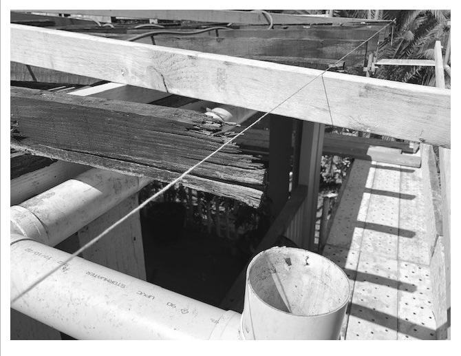
Rotten roof timbers once again. Entire front eaves also need replacing.