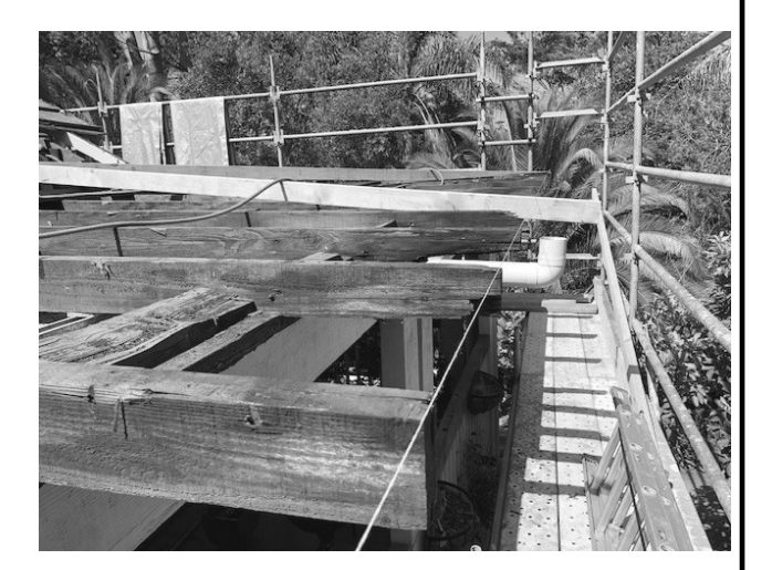
Rotten timbers in veranda roof